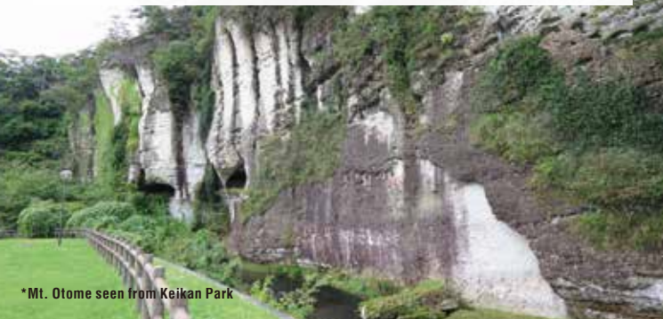
*Mt. Otome seen from Keikan Park

Mt. Otome of Ooyaji Temple has a scenic view of natural, strangely shaped rocks and red pine trees. It is referred to as "Matsushima on land" and was nationally designated as a Place of Scenic Beauty (July 2006). It is the second Place of Scenic Beauty to be recognized in Tochigi Prefecture, after Kegon Falls in Nikko.